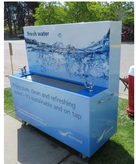
Portable drinking fountain