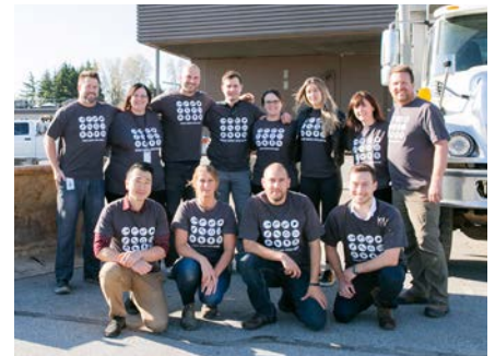
Public Works Open House Committee