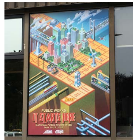
Window decals printed and installed by our Sign Shop