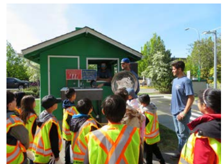
Demonstrating proper grease disposal and a blocked pipe