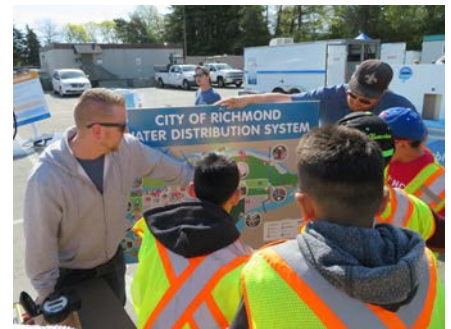
Explaining the water distribution system in Richmond