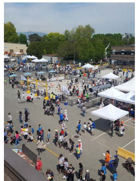
Aerial view of the event