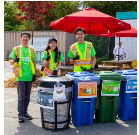
Richmond Green Ambassador volunteers

During the planning stages of the event, the committee took into consideration the environmental impact of the giveaways. It was recommended to booth leaders to distribute only reusable, purposeful and sustainable items. No balloons or plastic bags were permitted.