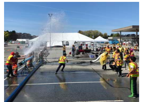
Getting 'wet' while showing how water pipes work