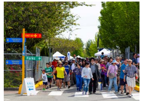
Opening of the gates at 11:00 a.m.