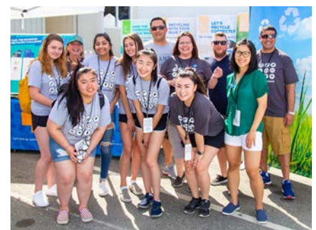
McMath leadership program students volunteering with City staff volunteers