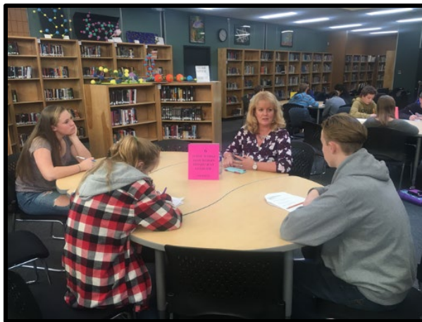
Career Day at Valleyview Secondary School