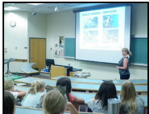
STEM Summer Camp for Girls